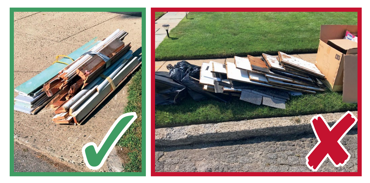
Set out rubbish in closed containers or tied. Corrugated cardboard should be flattened, bundled, and tied and set out with paper recycling.

SPECIAL NOTES: Items should be stored in closed containers or tied. Depending on the village or hamlet, only two or three 30- 32-gallon cans or the equivalent, weighing no more than 50 pounds, will be collected at a time.